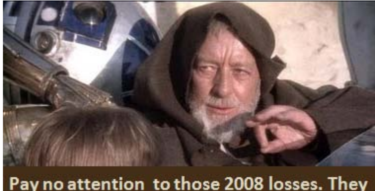
are not the warnings you're looking for.

Despite their popularity, target date funds (TDFs) are in need of serious reform. Sensible objectives should supplant the current foolishness. The current objectives of replacing pay and managing longevity risk are unrealistic, and lead to excessive risk near the target date. 2008